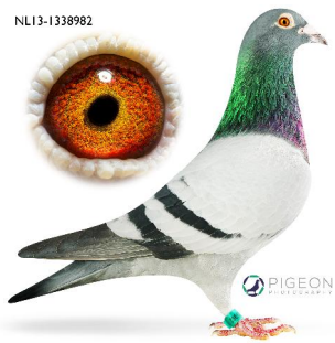
SON NPO MEN